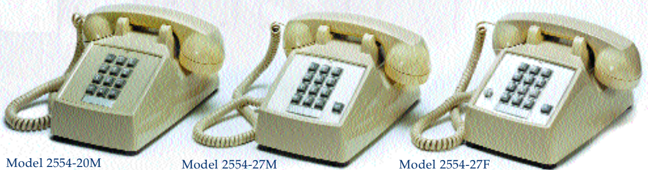
Model 2554-20M Basic