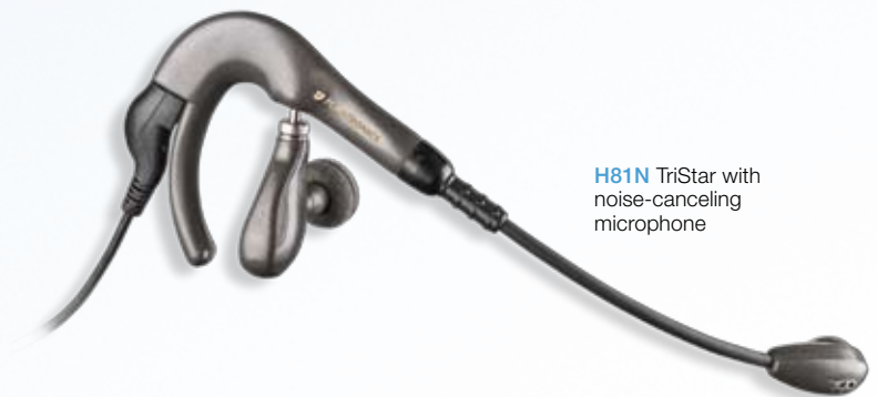
H81N TriStar with noise-canceling microphone

Get ultimate sound quality on traditional PBX phones, IP phones and wideband IP phones by combining your Plantronics TriStar headset with our latest corded amplifier—the Vista M22 with Clearline™ audio technology.